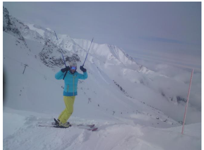
Powder heaven – Shymbulak – Kazakhstan