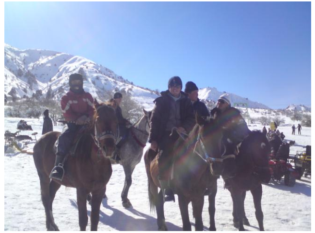
Ski lifts – Uzbek style!

Highlights of the trip were: holding a hunting eagle on my arm in Kyrgyzstan; steep, deep powder, mulled wine and outstanding hospitality in Georgia; staying in an old soviet style hotel in Armenia; and speaking Russian (and being understood!).