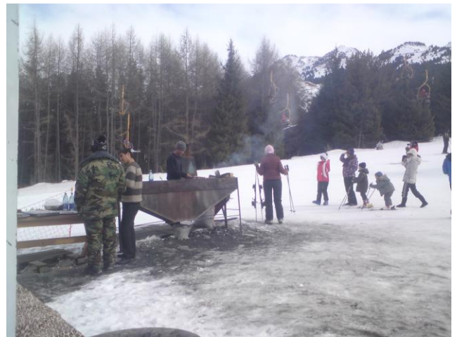
Lunchtime kebab – Karakol – Kyrgyzstan