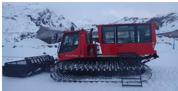
Get up to the club in comfort in the RAL snow shuttle.

Or Friday – Sunday 1pm – 5pm Phone: (027) 551 1854