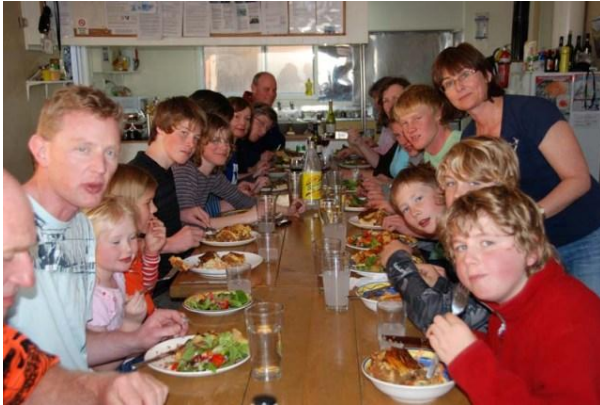
Club weekend 2010.

The club weekend was resurrected last year – it was very successful and enjoyable with club races and cups awarded for the first time in many years and a fun club dinner to top it off.